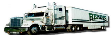
1000 lb shipments nationally