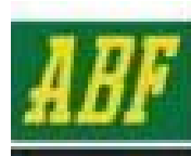
large item national shipping